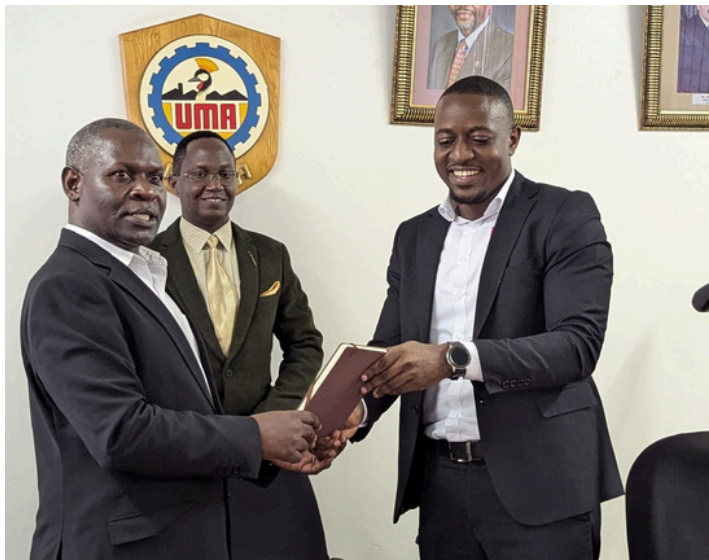
NEWLY ELECTED SECTOR HEAD

These policies look at streamlining revenue collection as well as transferring the regulatory mandate of the sector from the Uganda National Bureau of Standards to The Uganda National Drugs Authority. This has caused panic among sector players as the policies threaten the marketing, sales, and advertisement of these products and the likely consequences for the products to be treated as drugs, not goods.